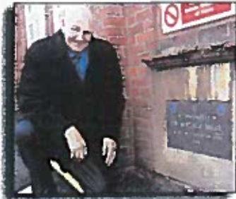
Our Chairman at Foundation Stone

Find us on the Web at: www.torbaycivicsociety.co.uk or email us at: office@torbaycivicsociety.co.uk