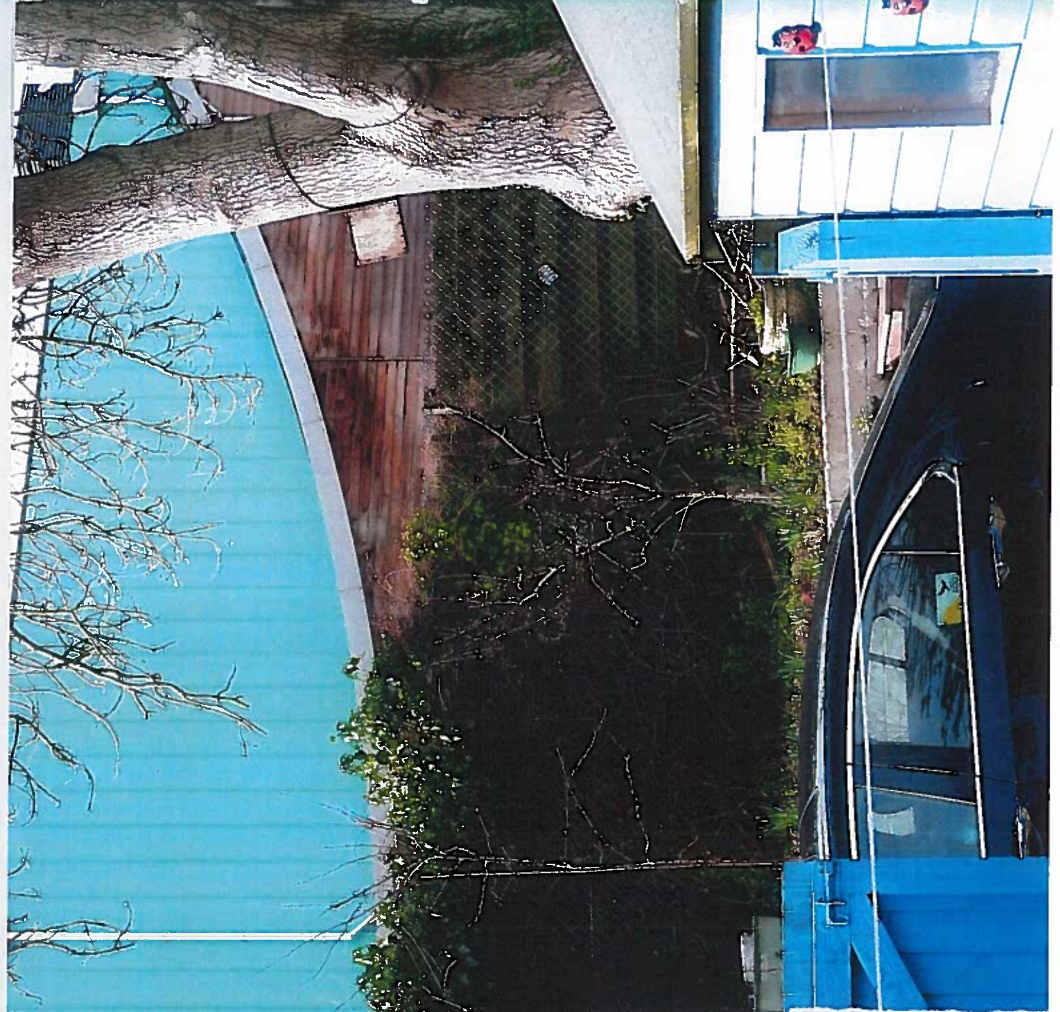
TELESCOPIC PHOTOGRAPH SHOWING (NEAR BIG TREE) OUR WIRE FENCE AND IMMEDIATELY BEHIND IT THE COUNCIL'S WOODEN FENCE (APPROX. 6-7 FT. HIGH FROM OUR SIDE).