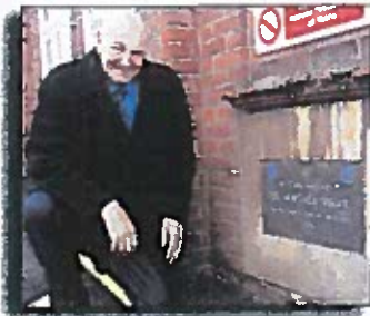
Our Chairman at Foundation Stone

Find us on the Web at: www.torbaycivicsociety.co.uk or email us at: office@torbaycivicsociety.co.uk