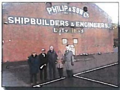
Members of the committee and a special guest attending the Noss at Kingswear.

Finally, the renamed Kistor Hotel has been fully restored to become the Belgrave Sands Hotel and my hope is that we will be one of the first groups to enjoy an afternoon event on January 19th. (See our forthcoming events)