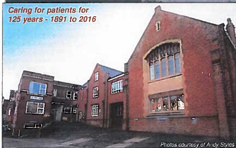
Paignton Cottage Hospital in Church Road, Paignton